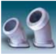
Discharge (Hose, BSP, NPT)