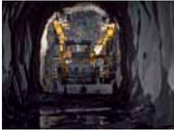
Mining & Tunnels